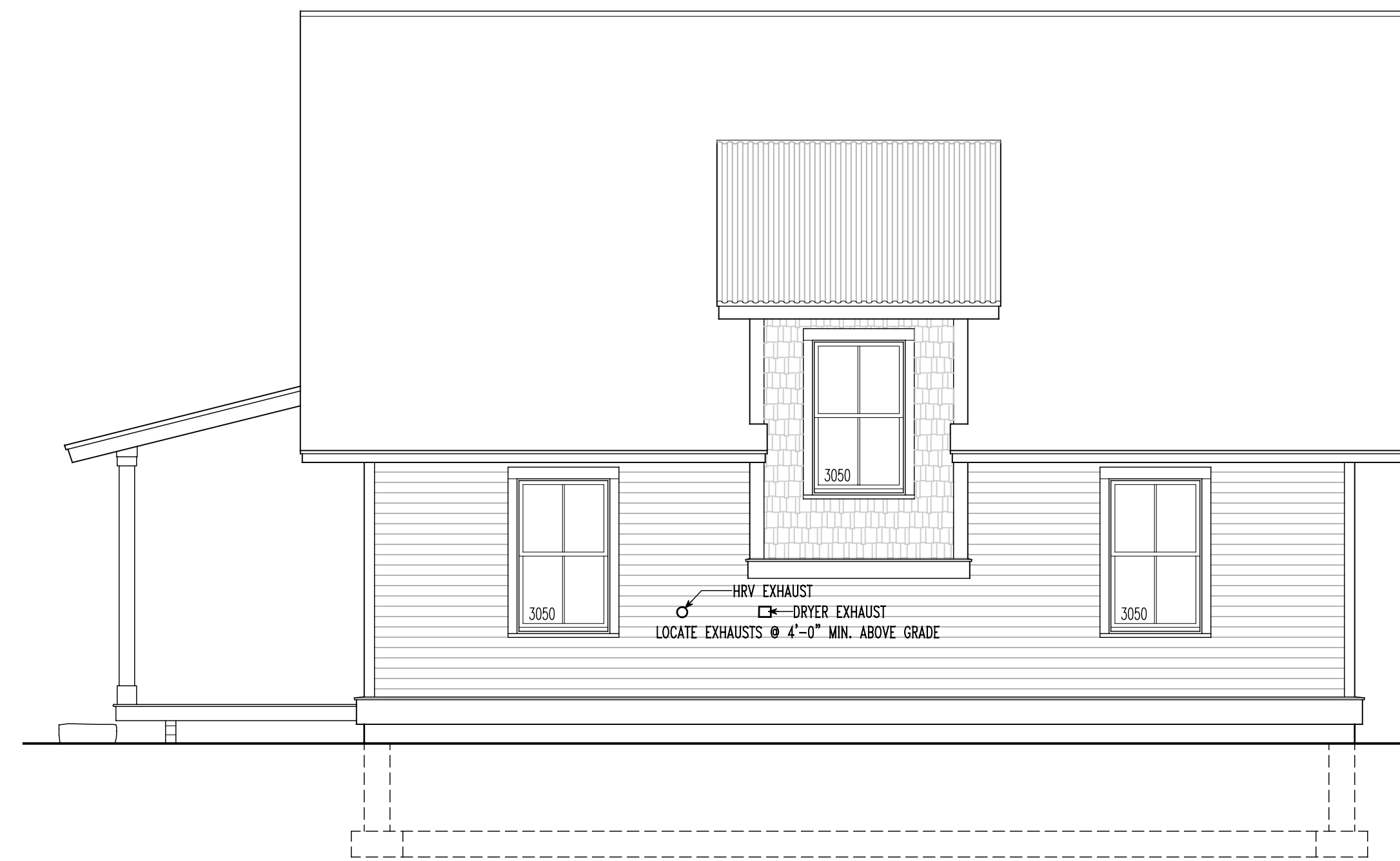
3 | RIGHT SIDE ELEVATION (WEST) SCALE 1/4" = 1'-0"