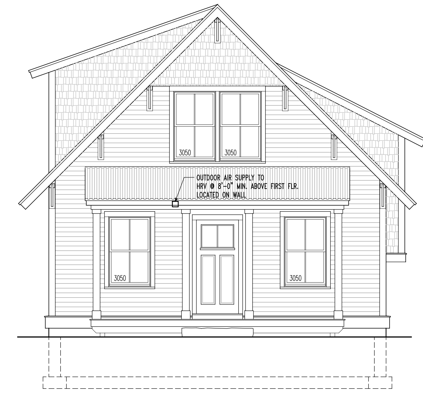
2 | FRONT ELEVATION (NORTH) SCALE 1/4" = 1'-0"