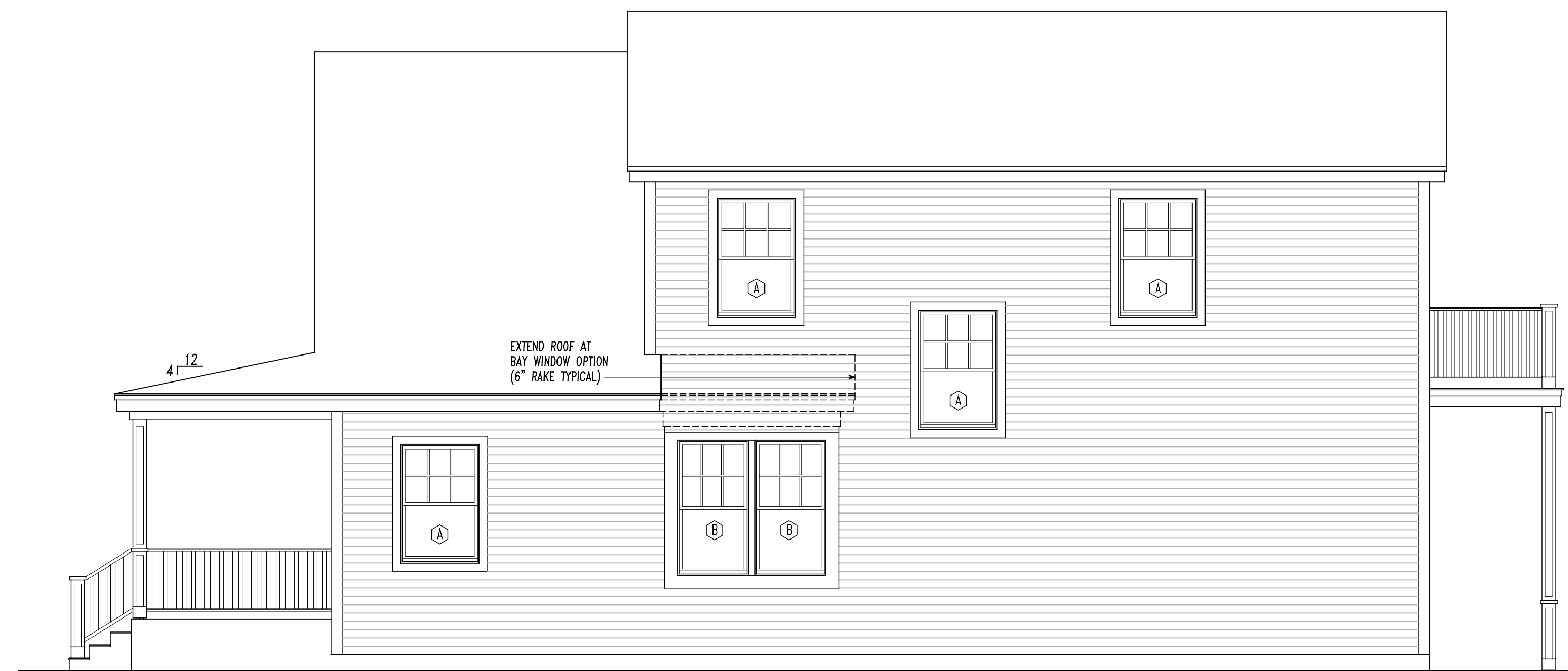
6 RIGHT SIDE ELEVATION SCALE 1/4" = 1'-0"