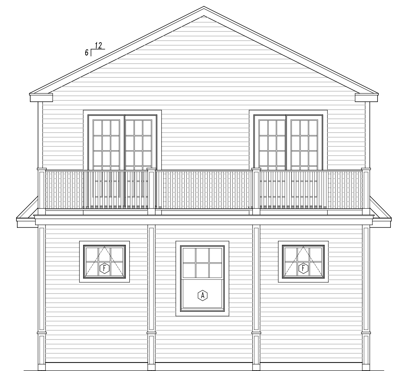
2 REAR ELEVATION (w/OPTIONAL REAR PORCH) SCALE 1/4" = 1'-0"

3/23/01 SUBMITTED FOR REVIEW 4/18/01 SUBMITTED FOR REVIEW