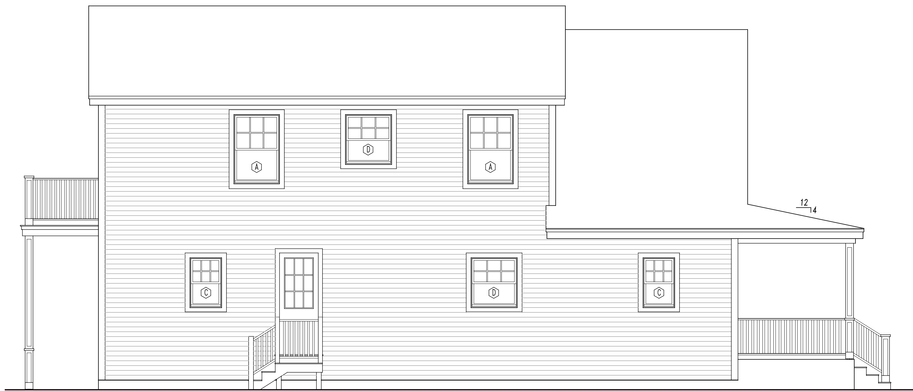
5 LEFT SIDE ELEVATION SCALE 1/4" = 1'-0"