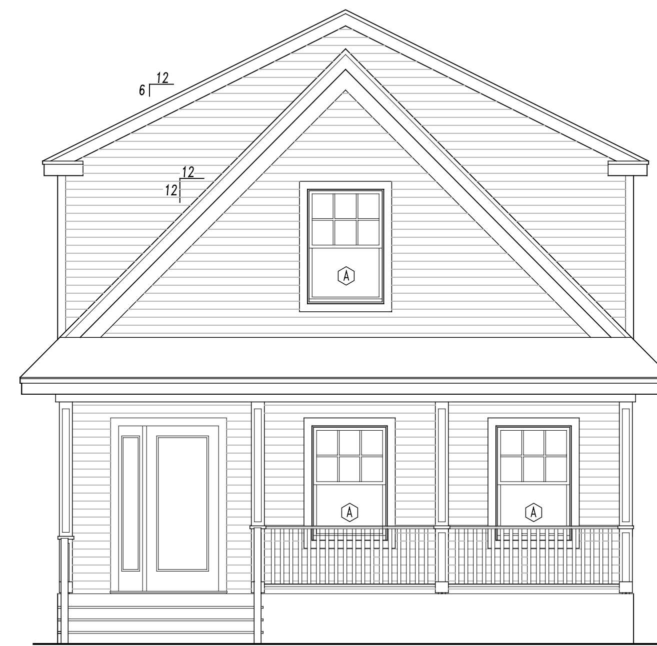
3 FRONT ELEVATION SCALE 1/4" = 1'-0"